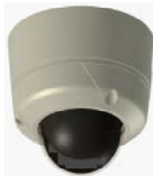
AirGoggle NVC 910 Compact Vandal Proof Speed Dome Camera with 10X Optical Zoom

Mechanically, the pan/tilt/zoom feature can be controlled locally via rs-485 interface or over the IP network for true remote surveillance. The 360 degrees pan with auto-flip allows for continuous circular movement with no restriction by traditional mechanical stop. The Auto flip feature can instantly flip the camera head 180 degrees and continue to pan beyond its zero point. The smooth and continuous camera movement can follow a person passing regardless of direction.