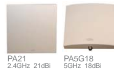
PA21 2.4GHz 21dBi