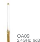
OA09 2.4GHz 9dBi