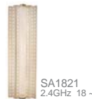
SA1821 2.4GHz 18 - 21dBi