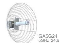
GA5G24 5GHz 24dBi