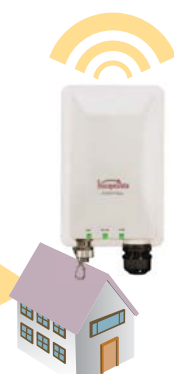
SC54 Dual Band Outdoor Wireless Client Bridge