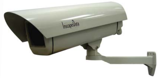
PCHB3100 Extended Length