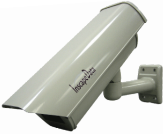
PCHB1300 Cable Management