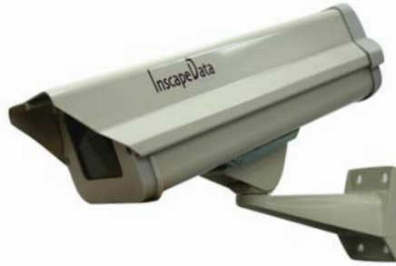
PCHB2200 Standard Enclosure