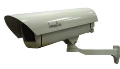
PCHB3100 All Weather (IP66) PoE Ready