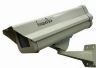
PCHB2200 All Weather PoE Ready