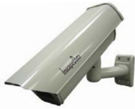
PCHB1300 All Weather PoE Ready